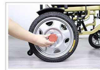
Manual/Electric Mode Switch