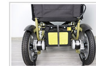
250W*2 Brush Motor